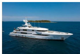
SPIRIT AMELS LOA: 54.35m (178' 4") Price: €25,900,000 EUR Loc: Appontement Jules Soccac S09

Beam: 9.4m (30' 10") Max Draft: 3.4m (11' 2") Model / Delivery Year: 2020 Gross Tonnage: 671.0000 Engines: 2x, MTU, 2000 M70 16V,