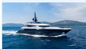
STARBURST III BILGIN YACHTS LOA: 47.4m (155' 7") Price: €21,500,000 EUR Loc: H14

Beam: 9.4m (30' 10") Max Draft: 2.4m (7' 11") Model / Delivery Year: 2017 Gross Tonnage: 499.0000 Refit: 2023 Engines: 1x, MTU,