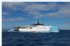
SHADOW DAMEN YACHTING LOA: 55.29m (181' 5") Price: €14,900,000 EUR Loc: Jules Soccac S12

Beam: 8.6m (28' 3") Max Draft: -- Model / Delivery Year: 2024 Gross Tonnage: 499.0000 Engines: 2x, CAT, C32 Acert, 1926 HP