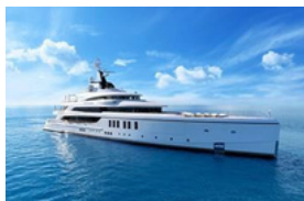
ARTISAN BENETTI LOA: 63m (206' 9") Price: €59,750,000 EUR

Beam: 12.6m (41' 4") Max Draft: 3.9m (12' 10") Model / Delivery Year: 2005 Gross Tonnage: 1495.0000 Refit: 2022 Engines: 2x, CAT, 3512B DITA SWAC,