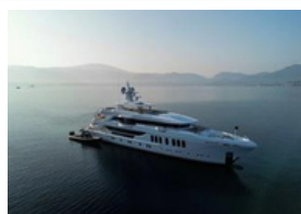
FORTUNA CMB YACHTS LOA: 47m (154' 3") Price: €25,000,000 EUR Loc: H11

Beam: 9m (29' 7") Max Draft: 2.65m (8' 9") Model / Delivery Year: 2024 Gross Tonnage: 499.0000 Engines: 2x, CAT, C32, 1450 HP