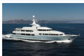
OLYMPUS FEADSHIP LOA: 55m (180' 6") Price: €23,723,595 EUR Loc: H18

Beam: 10m (32' 10") Max Draft: 3.2m (10' 6") Model / Delivery Year: 1996 Gross Tonnage: 881.0000 Refit: 2023 Engines: 2x, Caterpillar, 3516DI-TA (B series), 2600HP