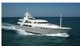
BELLA SENSATION LOA: 53.95m (177') Price: €14,900,000 EUR Loc: At anchor

Beam: -- Max Draft: 2.3m (7' 7") Model / Delivery Year: 2018 Gross Tonnage: 499.0000 Engines: 4x, MTU, 16V 2000 M96L,