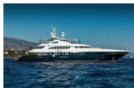
MY SECRET HEESEN YACHTS LOA: 46.7m (153' 3") Price: €21,600,000 EUR Loc: H12

Beam: 9.12m (29' 11") Max Draft: 3.02m (9' 11") Model / Delivery Year: 2024 Gross Tonnage: 491.0000 Engines: 2x, Caterpillar, C32 ACERT, 1218 HP