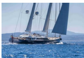
SALVAJE ALLOY YACHTS LOA: 56.4m (185' 1") Price: €29,500,000 EUR Loc: at anchor

Beam: 10.6m (34' 10") Max Draft: 3.4m (11' 2") Model / Delivery Year: 2019 Gross Tonnage: 1245.0000 Refit: 2022 Engines: 2x, MTU, 12V4000M53, 1810 HP