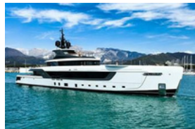
ADMIRAL 55 S-FORCE SILVER STAR I ADMIRAL YACHTS LOA: 55.3m (181' 6") Price: €35,000,000 EUR Loc: R06

Beam: 10.2m (33' 6") Max Draft: 3.6m (11' 10") Model / Delivery Year: 2011 Gross Tonnage: 985.0000 Refit: 2019 Engines: 2x, Caterpillar, 3512B, 1575 HP