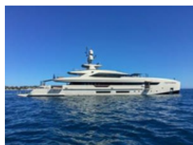
VERTIGE TANKOA YACHTS LOA: 49.9m (163' 9") Price: €26,500,000 EUR Loc: Appontement Jules Soccac: Berth S17

Beam: 9.11m (29' 11") Max Draft: -- Model / Delivery Year: 2011 Gross Tonnage: 620.0000 Refit: 2024 Engines: 2x, Cummins, KTA-38-MI, 1100 HP