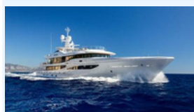
GALENE AMELS LOA: 55m (180' 6") Price: €39,950,000 EUR Loc: R01

Beam: 10m (32' 10") Max Draft: 3.2m (10' 6") Model / Delivery Year: 1996 Gross Tonnage: 881.0000 Refit: 2023 Engines: 2x, Caterpillar, 3516 DI-TA (B series) Diesel,