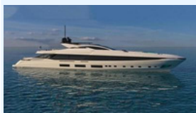
EL LEON OVERMARINE GROUP LOA: 54m (177' 2") Price: €27,750,000 EUR Loc: AT ANCHOR

Beam: 11m (36' 1") Max Draft: -- Model / Delivery Year: 2014 Gross Tonnage: 498.0000 Refit: 2024 Engines: 1x, Caterpillar, C32,