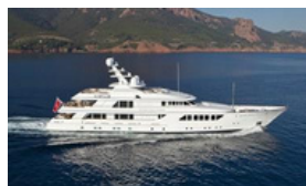
KAHALANI FEADSHIP LOA: 55.05m (180' 8") Price: €39,750,000 EUR Loc: Quai de l'Hirondelle - H17

Beam: 9.27m (30' 5") Max Draft: 3.3m (10' 10") Model / Delivery Year: 2017 Gross Tonnage: 489.0000 Refit: 2023 Engines: 4x, Caterpillar, 3512C 1118kW,