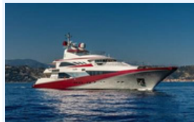
JOYME PHILIP ZEPHTER YACHTS LOA: 49.9m (163' 9") Price: €11,700,000 EUR Loc: S14

Beam: 9.2m (30' 3") Max Draft: 1.9m (6' 3") Model / Delivery Year: 2017 Gross Tonnage: 485.0000 Refit: 2022 Engines: 4x, MTU, 16V 2000 M94, 2600 HP