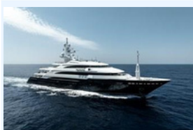
AALTO OCEANCO LOA: 80m (262' 6") Price: €79,750,000 EUR Loc: At Anchor

Beam: 14.2m (46' 7") Max Draft: 3.9m (12' 10") Model / Delivery Year: 2007 Gross Tonnage: 2310.0000 Engines: 2x, MTU, 16V 595 TE 70, 3492 kW @ 1750 rpm,