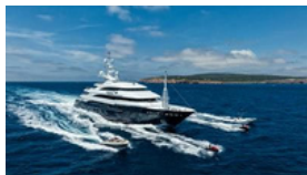
Y701 OCEANCO LOA: 80m (262' 6") Price: €79,750,000 EUR

Beam: 14.2m (46' 7") Max Draft: 3.9m (12' 10") Model / Delivery Year: 2007 Gross Tonnage: 2310.0000 Engines: 2x, MTU, 16V 595 TE 70, 3492 kW @ 1750 rpm,