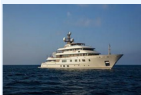
POLAR STAR LURSSEN LOA: 65.17m (213' 10") Price: €49,000,000 EUR Loc:

Beam: 12.6m (41' 4") Max Draft: 3.91m (12' 10") Model / Delivery Year: 2005 Gross Tonnage: 1495.0000 Refit: 2022 Engines: 2x, Caterpillar, 3512B DITA SWAC,