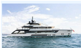
SERENISSIMA I MENGI YAY LOA: 47m (154' 3") Price: €35,800,000 EUR Loc: E08

Beam: 8.61m (28' 3") Max Draft: 1.98m (6' 6") Model / Delivery Year: 2016 Gross Tonnage: 484.0000 Refit: 2023 Engines: MAN, VZ 450 CR made by VETH,