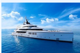
ARTISAN BENETTI LOA: 63m (206' 9") Price: €59,750,000 EUR Loc:

Beam: 10.6m (34' 10") Max Draft: 3.4m (11' 2") Model / Delivery Year: 2019 Gross Tonnage: 1245.0000 Refit: 2022 Engines: 2x, MTU, 12V4000M53, 1810 HP