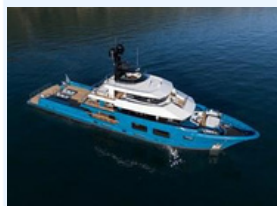
KING BENJI DUNYA YACHTS LOA: 46.99m (154' 2") Price: €40,285,350 EUR Loc: S19

Beam: 9.5m (31' 2") Max Draft: 2.7m (8' 11") Model / Delivery Year: 2022 Gross Tonnage: 500.0000 Engines: 2x, CAT, C32, 1800 HP