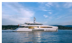
BARTALI WIDER LOA: 47.06m (154' 5") Price: €19,800,000 EUR Loc: H22

Beam: 8.75m (28' 9") Max Draft: 2.5m (8' 3") Model / Delivery Year: 2017 Gross Tonnage: 494.0000 Refit: 2019 Engines: 2x, MTU, 12V 2000 M72,