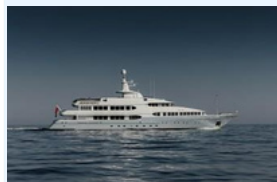
OLYMPUS FEADSHIP LOA: 55m (180' 6") Price: €23,723,595 EUR Loc: H18

Beam: -- Max Draft: -- Model / Delivery Year: 2010 Gross Tonnage: 891.0000 Engines: 1x, Caterpillar,