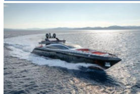
BLACK LEGEND OVERMARINE GROUP LOA: 49.9m (163' 9") Price: €26,900,000 EUR Loc: Quai Chicane - C17

Beam: 9.2m (30' 3") Max Draft: 1.9m (6' 3") Model / Delivery Year: 2017 Gross Tonnage: 485.0000 Refit: 2022 Engines: 4x, MTU, 16V 2000 M94, 2600 HP