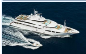
AIFER CRN LOA: 59.8m (196' 3") Price: €31,500,000 EUR Loc: Quai des Etats-Unis - E11

Beam: 10.2m (33' 6") Max Draft: 3.6m (11' 10") Model / Delivery Year: 2011 Gross Tonnage: 985.0000 Refit: 2019 Engines: 2x, Caterpillar, 3512B, 1575 HP