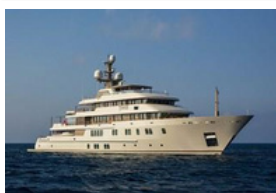
POLAR STAR LURSSEN LOA: 65.18m (213' 10") Price: €49,000,000 EUR

Beam: 14.2m (46' 7") Max Draft: -- Model / Delivery Year: 2007 Gross Tonnage: 2310.0000 Refit: 2019 Engines: 1x, MTU,