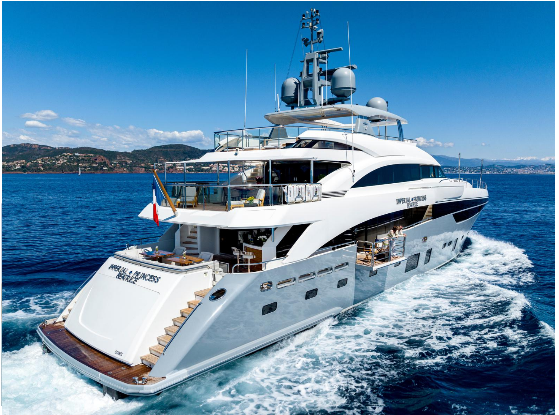
IMPERIAL PRINCESS BEATRICE PRINCESS 40