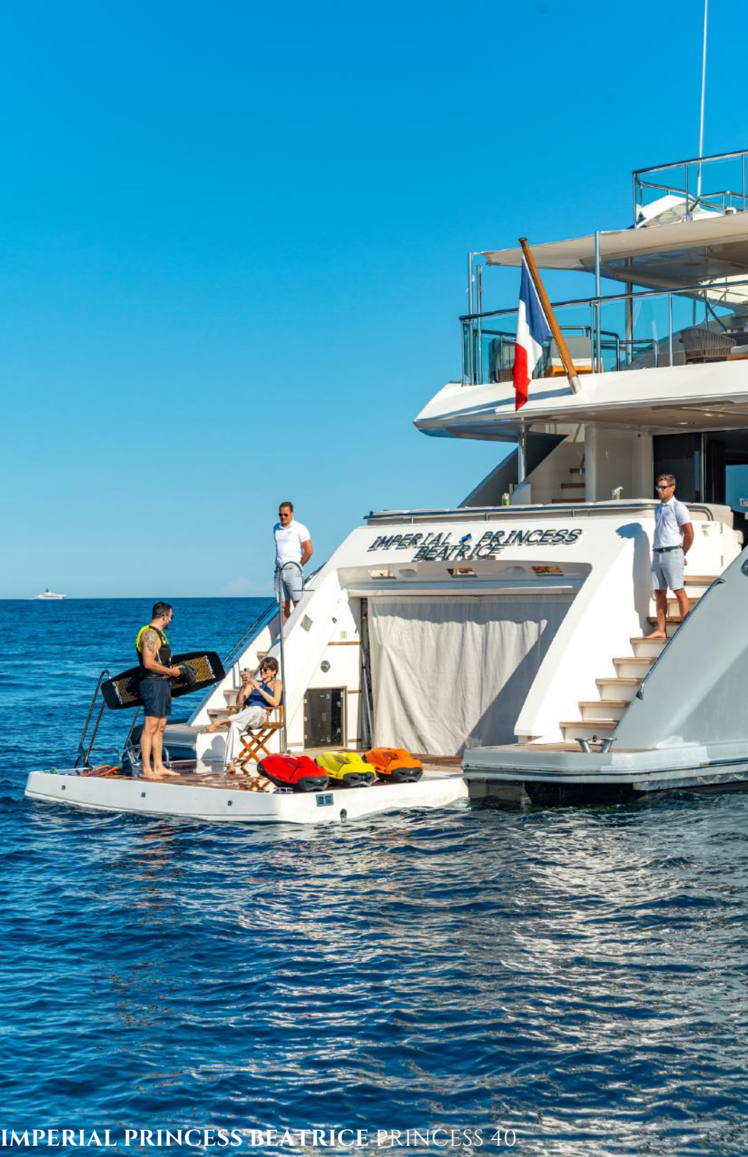
IMPERIAL PRINCESS BEATRICE PRINCESS 40