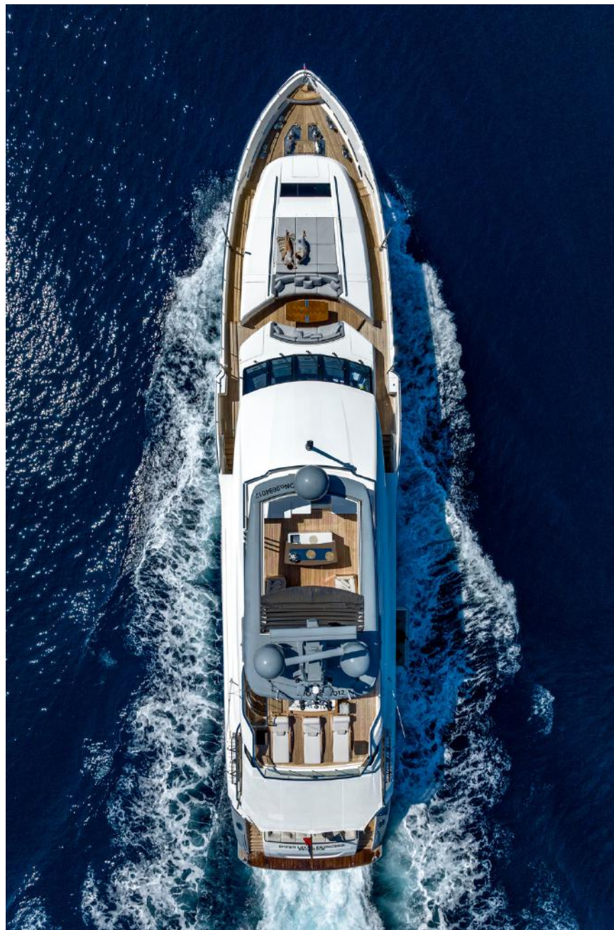
IMPERIAL PRINCESS BEATRICE PRINCESS 40