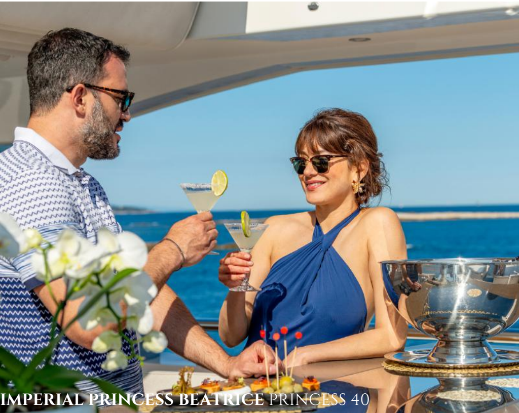
IMPERIAL PRINCESS BEATRICE PRINCESS 40