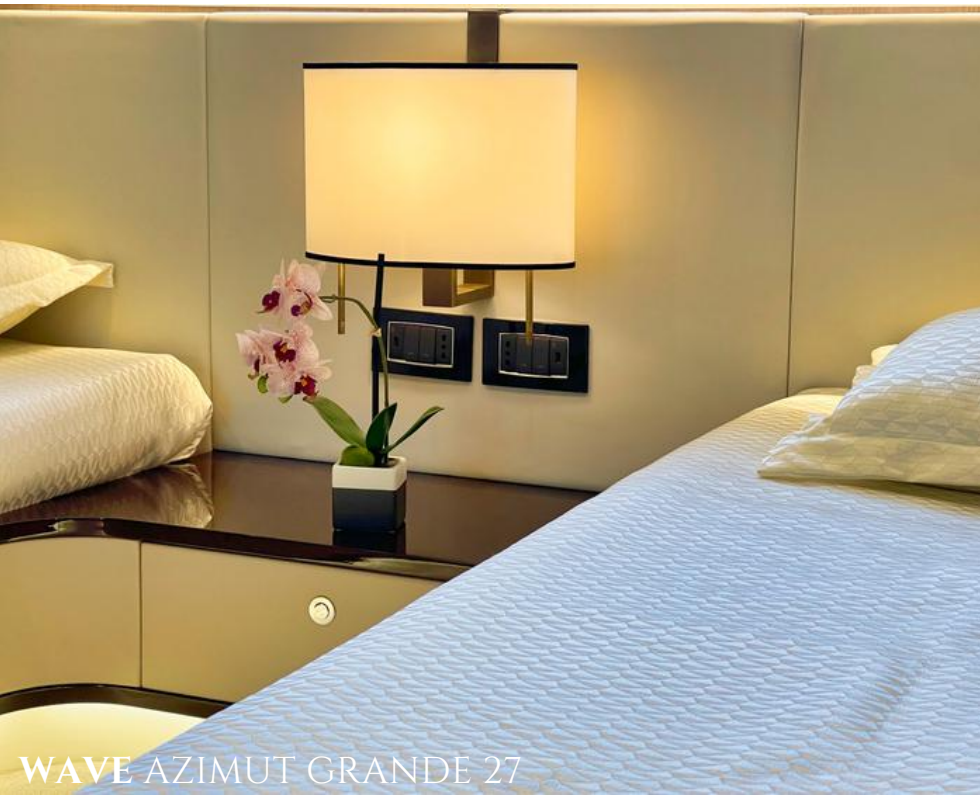
WAVE AZIMUT GRANDE 27