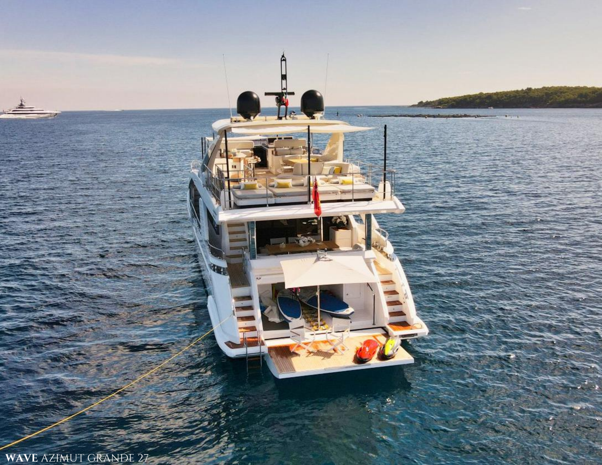
WAVE AZIMUT GRANDE 27