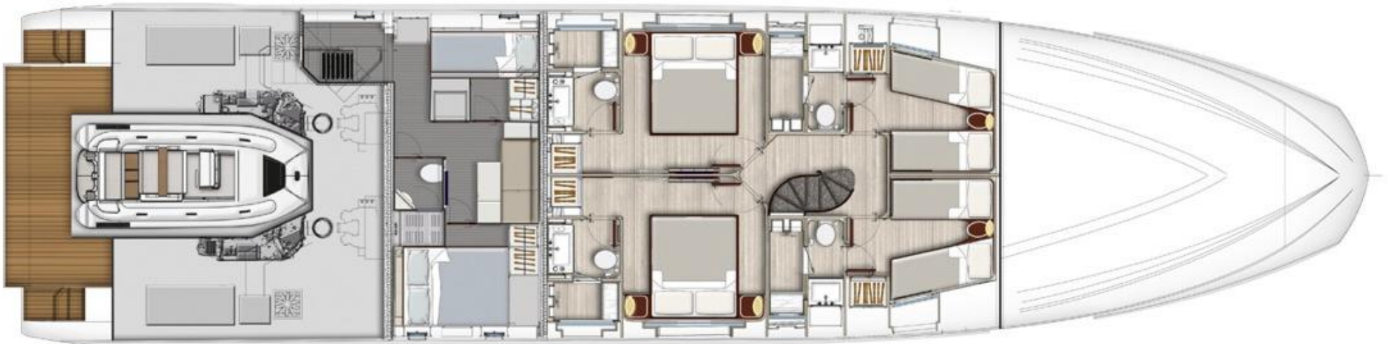
LOWERDECK - 5 CABINS LAYOUT (OPT)