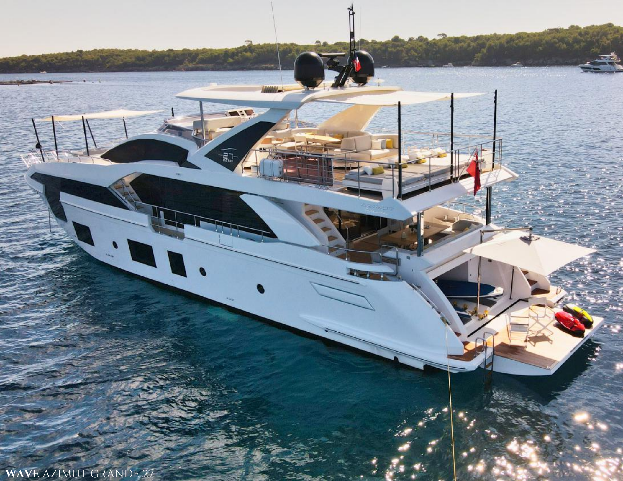
WAVE AZIMUT GRANDE 27