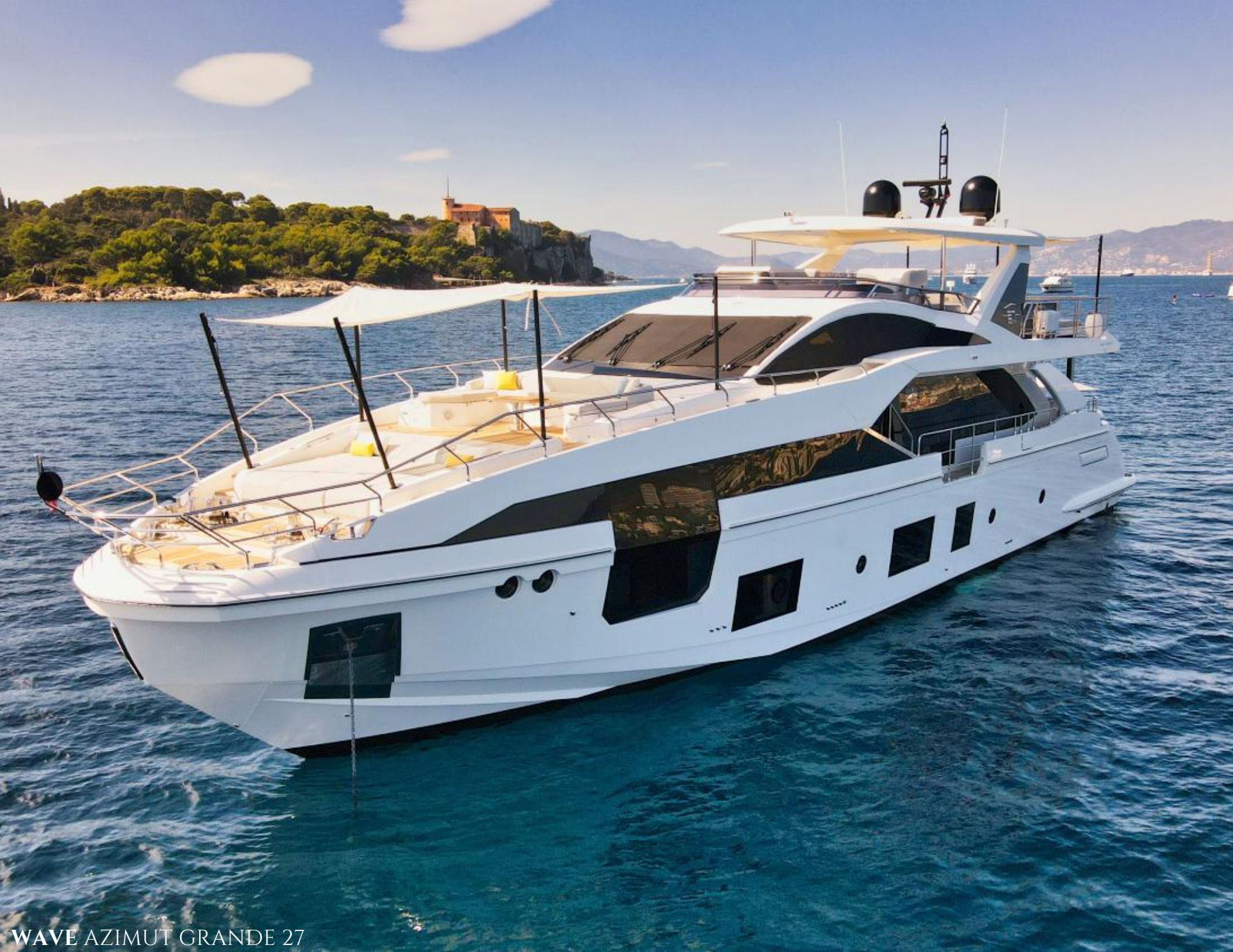
WAVE AZIMUT GRANDE 27